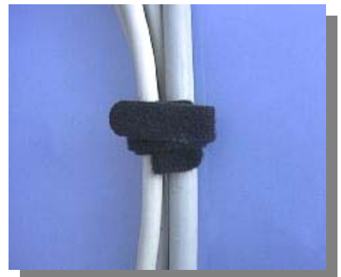
Instantly bundle the remaining cable