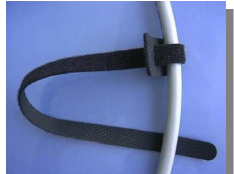
Placer the tie around the main cable