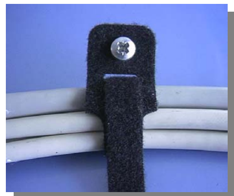
Affix the bundle to a support by using a screw or rivet

All statements contained herein are for information only and are not contractual. For orders and specific information, please contact Capatex or your distributor.